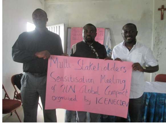
Snap shot with Participants after the UN Global Compact meeting