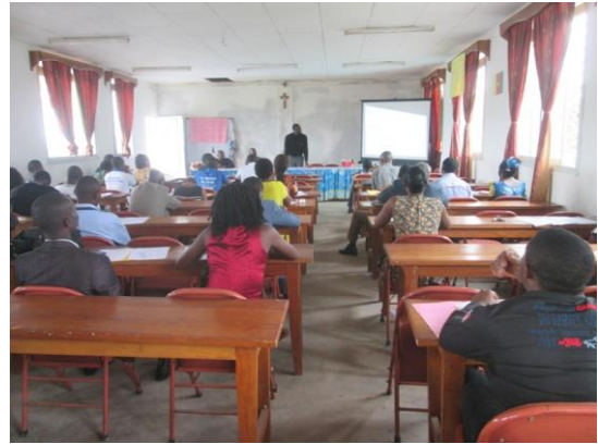
Snap shot with Participants after the UN Global Compact meeting